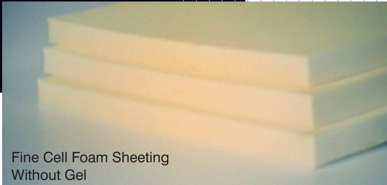
Fine Cell Foam Sheeting Without Gel